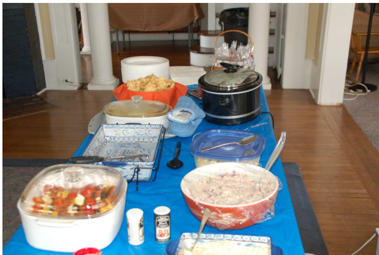
Waiting for the fried chicken, the main table at Whitehall Bay