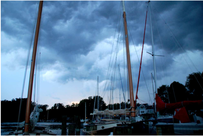
View to the West as the thunder storm rolls through Providence marina.

rain and also retrieved the three Marshall Sanderlings who had launched from trailers in Prospect Bay and were looking for the rest of the fleet. While venting their frustration, the crews of the Marshall Cats (plus dogs - Biscuit and LuLu) came ashore at the Compton's pier or an adjacent neighbors pier. A well supplied bar and a dry house kept everyone happy through an equally well supplied dinner. Normal presentations of trophies had to be postponed until the next day when the race results would be known. The trailer sailors