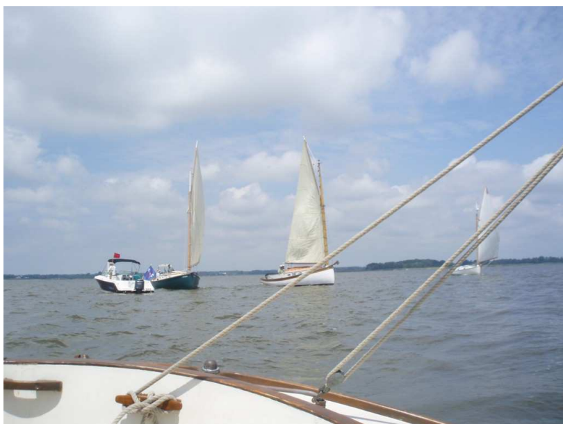
The view of the finish line from Gull's transom

Saturday morning early the fleet sailed through a light fog to the Corsica River and dropped anchor off the Corsica River Yacht Club property. A skippers meeting with coffee and donuts provided,