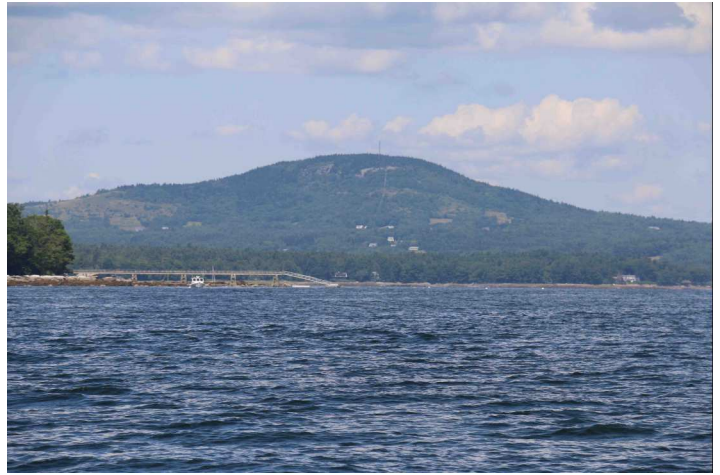
Blue Hill Maine, new home of Caerulean III

brush with bad weather, passage through the Cape Cod Canal