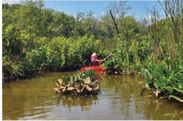
Friends of Arundel Rivers Federation explore a marshy creek.