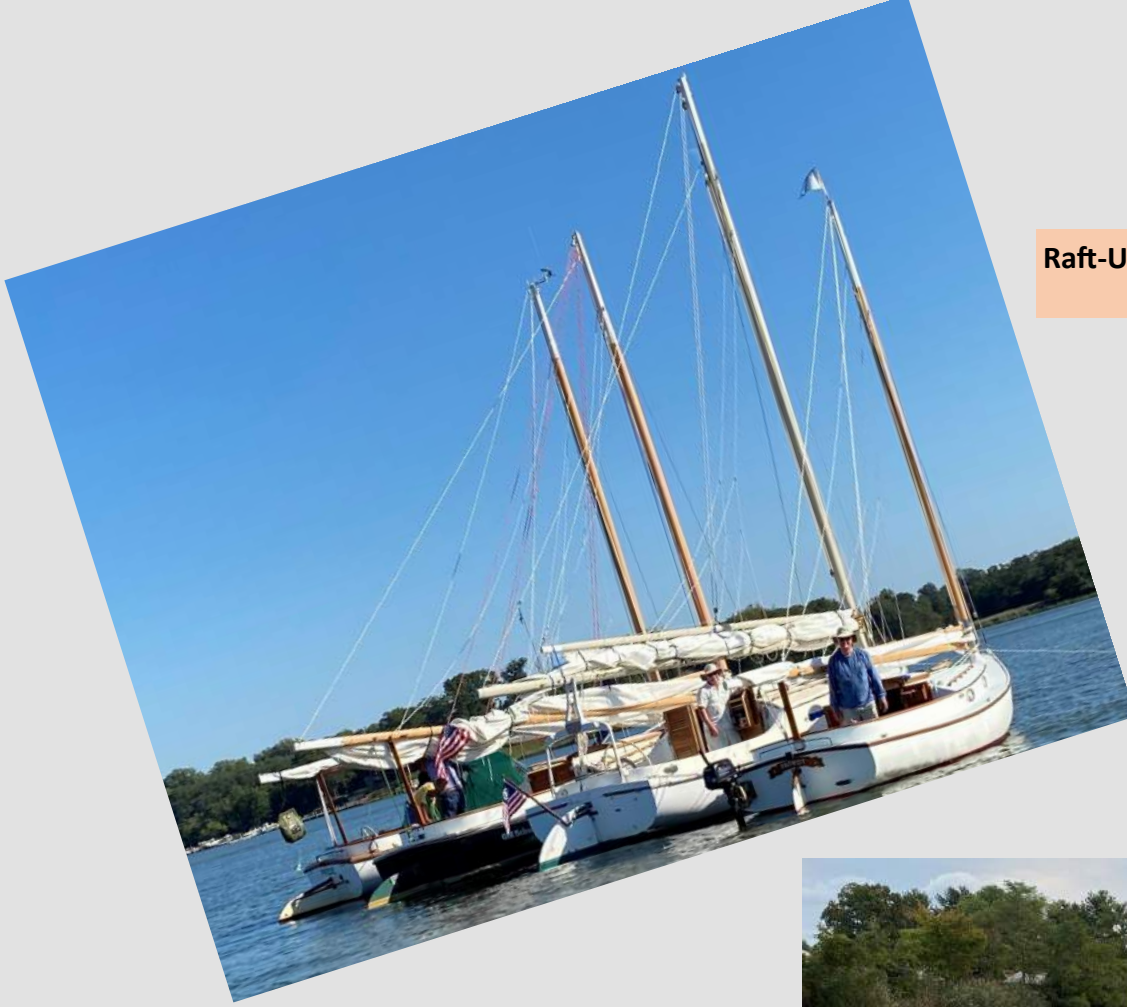
Raft-Up at Veazy Cove.