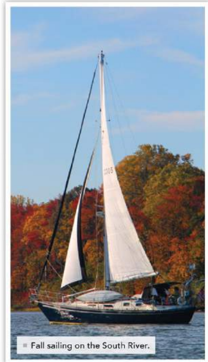
■ Fall sailing on the South River.

Goods weren't the only thing those early ferrymen transported. Passengers were also a big part of the revenue