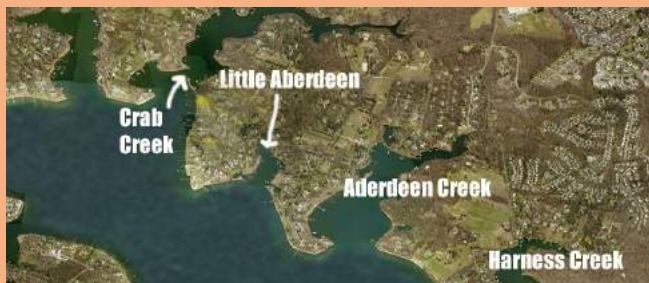
Turn right at South River red marker # 12.