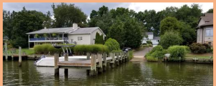
Community Dock at Little Aberdeen Creek.