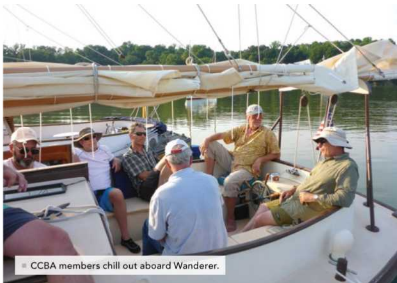
■ CCBA members chill out aboard Wanderer.