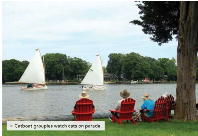
■ Catboat groupies watch cats on parade.