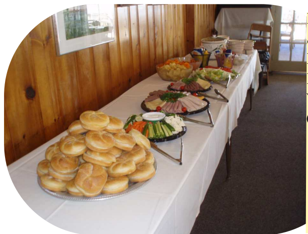
Lunch at the Rock Hall Yacht Club,