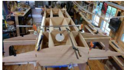
Bottom-up view of module.

“This will be my 4th boat as a member. The only catboat was the first, a Whitholz 17 made by Cape Cod Shipbuilding. A lovely boat, but hard to trailer (mast-stepping, launching, recovery, etc). Then I made “Tattoo,” a Chesapeake Light Craft kit boat and sailed her for 4 seasons. I found her to be too small for comfortable cruising. Next a glass ComPac Eclipse which, at 4,000 lbs (trailer & boat) was too