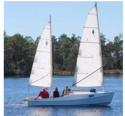
The prototype under sail.

—Peter McCrary, “Chessie” boat builder and skipper.