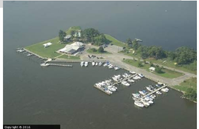
Kent Island Yacht Club