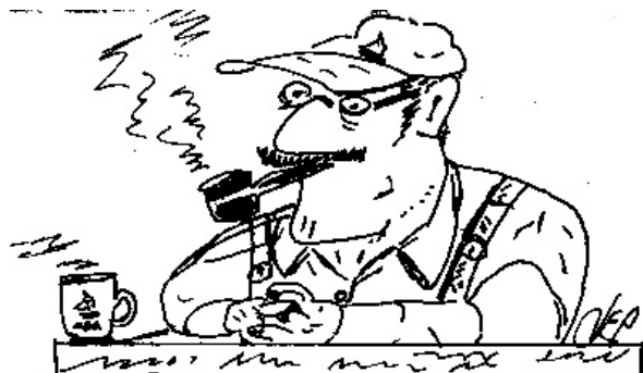
31 Foot Cat Ketch, Wood and Traditional ?

We had a quorum for our annual meeting, at least 35 members showed up at the Severn Inn and the room was set for 48 so there was space for expansion. The exhibit tables held a couple