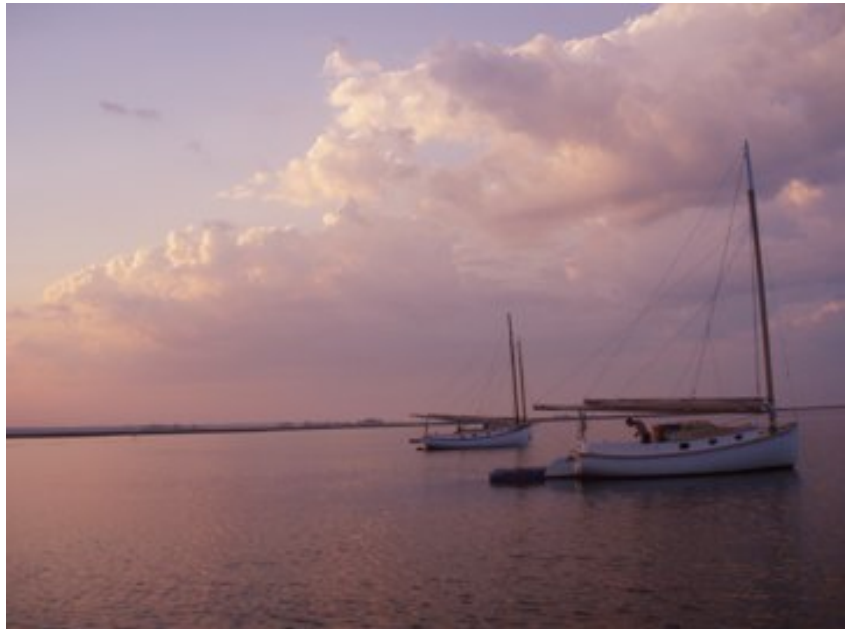
Sunrise over quiet Dames Quarter.

Friday morning the fleet split up. Bill Bell sailed for home. Dusty, Gull and Wanderer sailed for Crisfield to explore the Annemessex canal behind Jane's Island State Park. The canal was wide and the wind from behind made sailing up the canal easy. Unfortunately, too easy. An imprudent decision to try to take a photo while sailing left Gull with a creosoted hull from scraping a sea-wall in the park. The rest of the fleet sailed the direct route west out of Smith Island then through Kedges Strait and up the