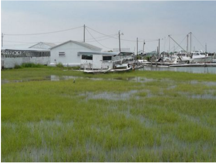
Dry land is rare on Smith Island.